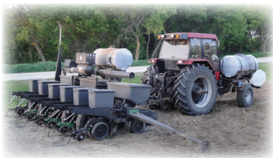
New Concept Planter for the U-Trough Approach Placement of Nutrients

2907 County Road I6 SW • Rochester, MN 55902